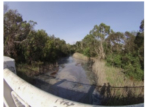
January 2016